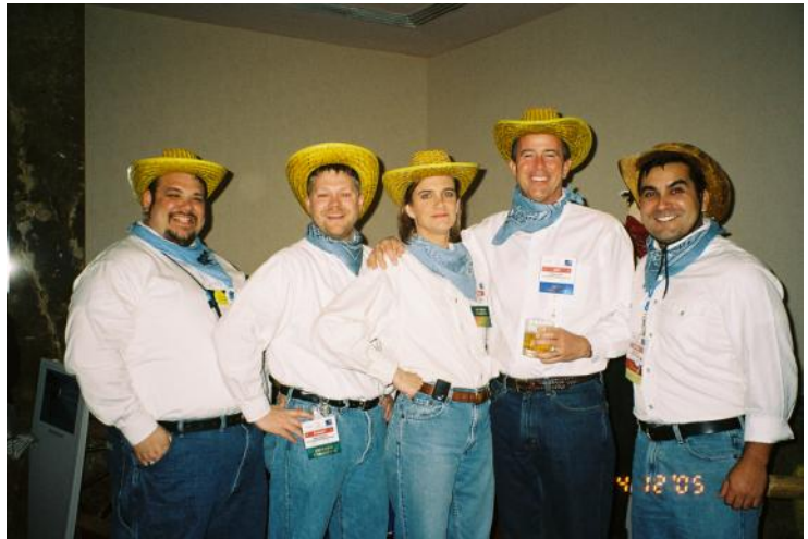
Don't you hate coming to a function to find someone else is wearing your outfit?

Recognize a friend? Send them a quick “hello!”