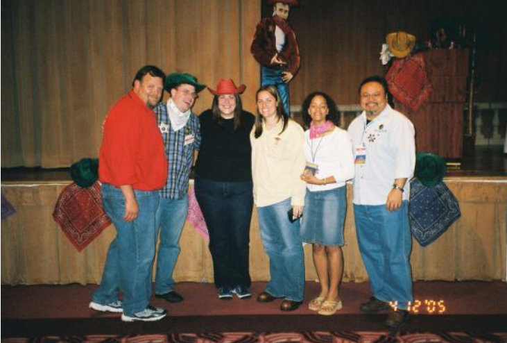
Case study judges and winners celebrate their success.

Recognize a friend? Send them a quick “hello!”