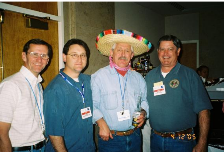
Exhibits committee members showing off their sense of style