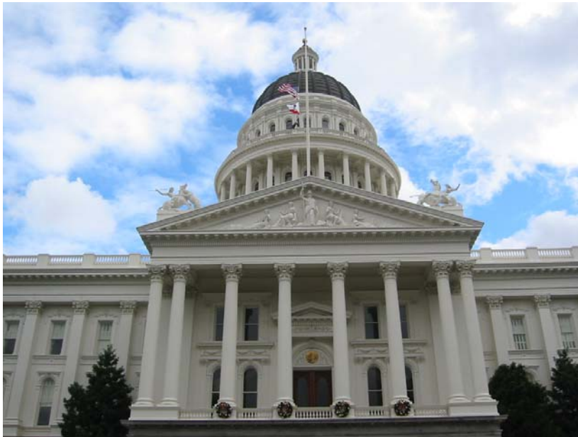
State Capitol, Sacramento, CA

Thanks to our colleagues and friends at UC Davis, who have agreed to host the WACUHO 2008 Conference in Northern California, March 16-19, 2008. Mark your calendars now!!! The incoming Executive Committee tentatively approved the bid at the recent June transition meeting with the conference slated to occur at the Hyatt Regency in Sacramento (site of the 1997 WACUHO Annual Conference "Capitol Connections"). At this time, other logistics are being working out by the Host site, so stay tuned for more details to come.