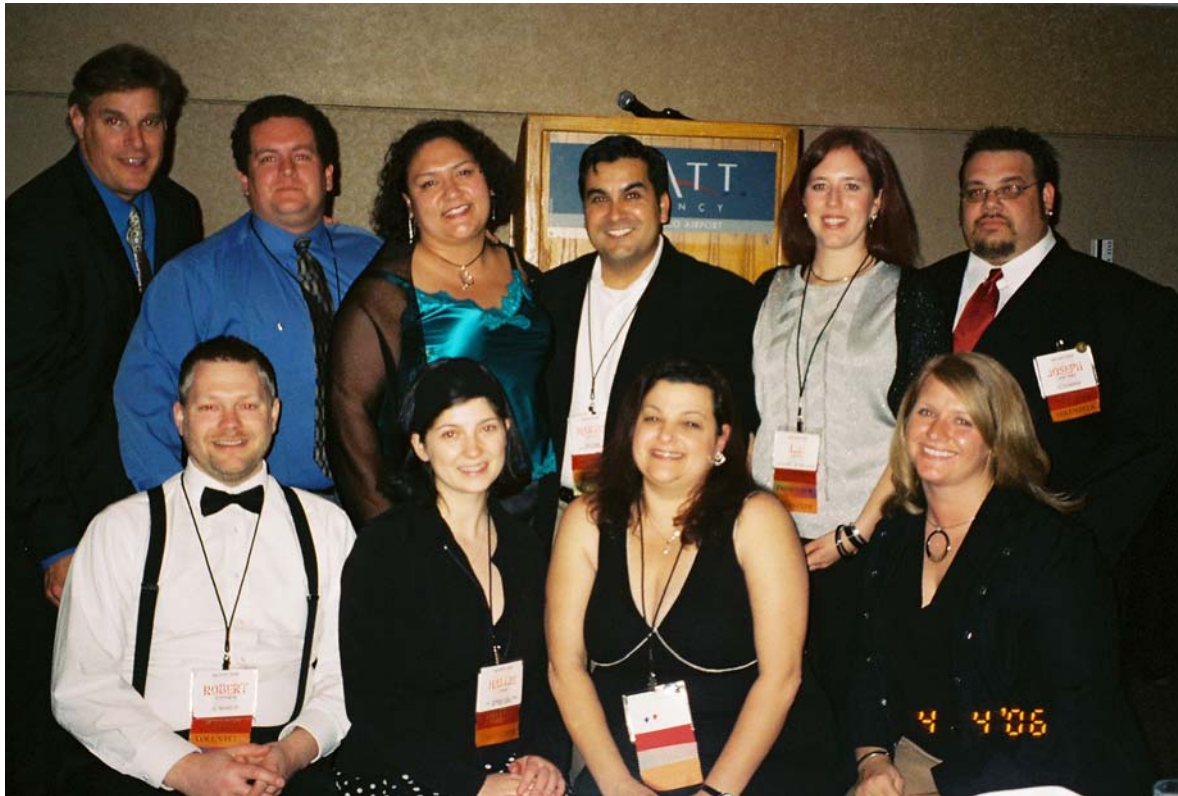
2005-2006 Execs at the 50th Annual Conference