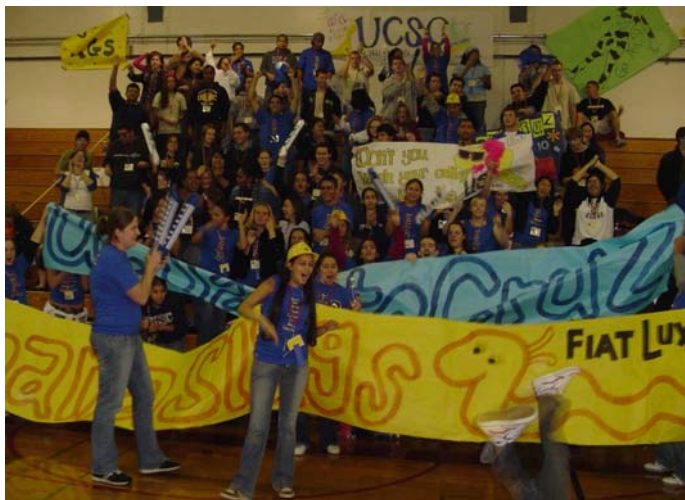
UCSC won the Spirit Competition