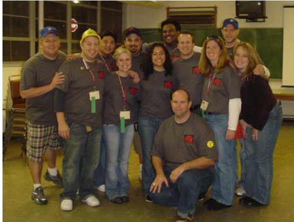
The 2005 NRAP Committee

On Saturday, November 5, 2005 more than 550 participants from over 30 schools in the Northern WACUHO region convened at California State University, Chico for the 2005 Northern RAP conference. This year's theme, "Extreme Make-over: NRAP Edition," was reflected in the spirit of not only the participants, but also the 61 program submissions we received. Additionally, Northern RAP made itself over by having its first student keynote