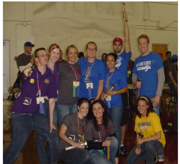
Top 5 Award winners pose for the camera